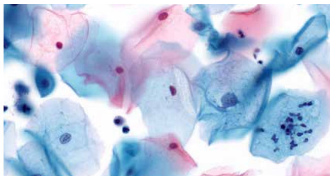
Pap smear at 40x oil